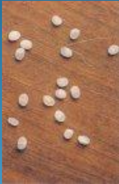
45% milled Ginjo grade